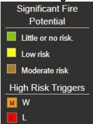
Table 4-3: Significant Fire Potential

The Field Operations Supervisor will monitor the fire risk as designated by the consultant meteorologist, the NFDRS fire danger forecast, and indications from installed weather stations, which are equipped with alarms based on actual wind speed and then direct the proper operational pre-planned response. As indicated in Table 4-4 below, "Brown", "Red", and "Orange" are considered elevated fire threat conditions that require the BVES system to be configured for fire prevention over reliability concerns.