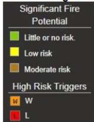
Table 4-3: Significant Fire Potential

The Field Operations Supervisor will monitor the fire risk as designated by the consultant meteorologist, the NFDRS fire danger forecast, and indications from installed weather stations, which are equipped with alarms based on actual wind speed and then direct the proper operational pre-planned response. As indicated in Table 4-4 below, “Brown”, “Red”, and “Orange” are considered elevated fire threat conditions that require the BVES system to be configured for fire prevention over reliability concerns.